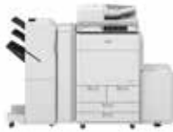
C7580i III: 80/70 ppm; C7570i III: 70/65 ppm