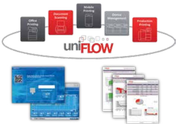
Control Device Access Monitor and Track Usage