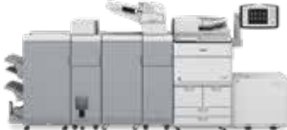
8505 III: 105 ppm; 8595 III: 95 ppm 8585 III: 85 ppm