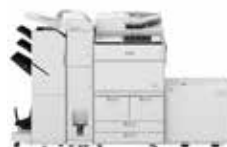
6575i III: 75 ppm; 6565i III: 65 ppm 6555i III: 55 ppm