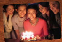
HS system enabled