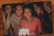
HS system disabled